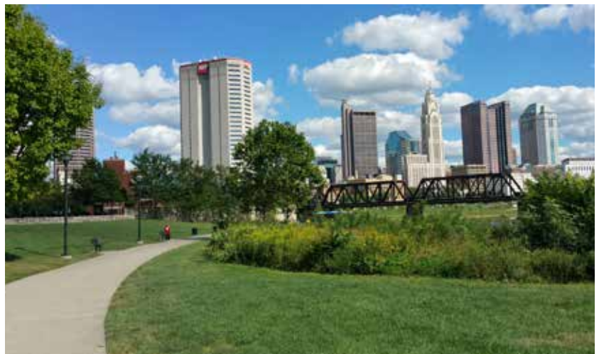
OTET approaching downtown Columbus in Franklin County