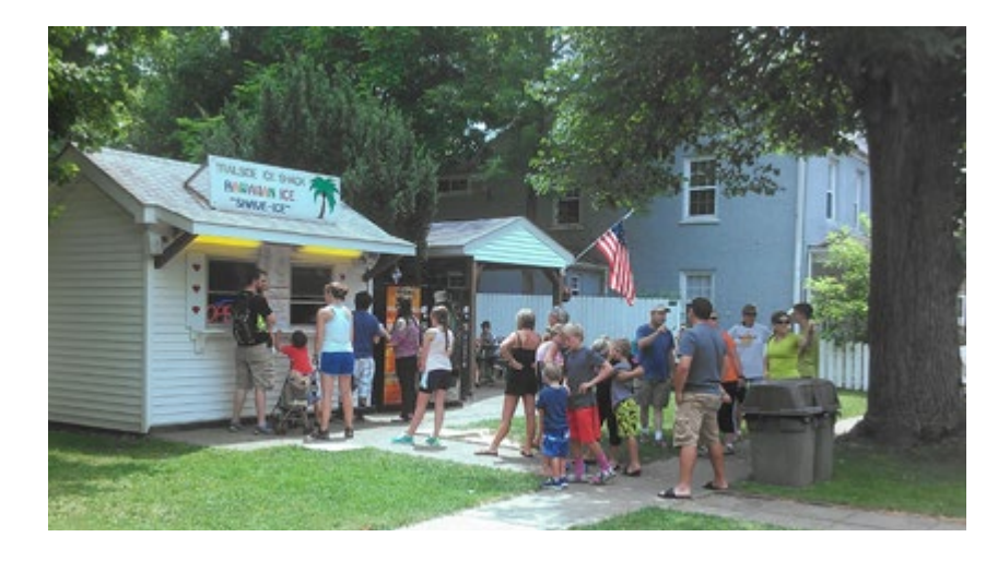
Trailside Ice Shack serves up the cool treats on a hot summer day in Loveland, Ohio