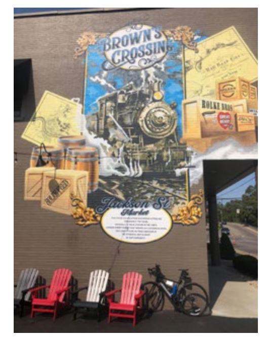
A new public art installation tells the story of the region