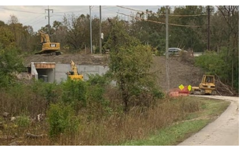
Construction of the Beechmont Connector along the Little Miami Scenic Trail

A TAP grant has been awarded in partnership with the city of Orrville.