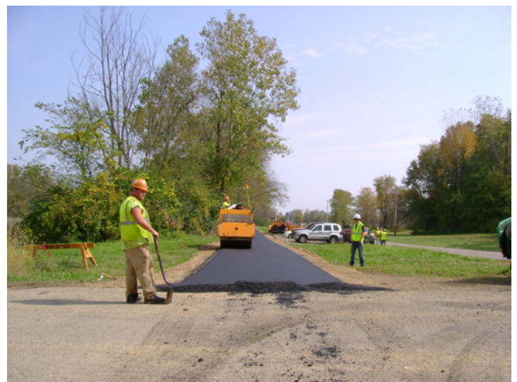
Construction on the Heart of Ohio Trail in 2012.