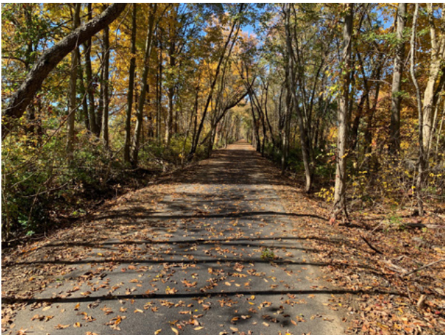
A new section of the trail in Delaware County

County. A Clean Ohio Recreational Trail grant of $500,000 and your donations contributed to the funding to make this segment’s completion possible.