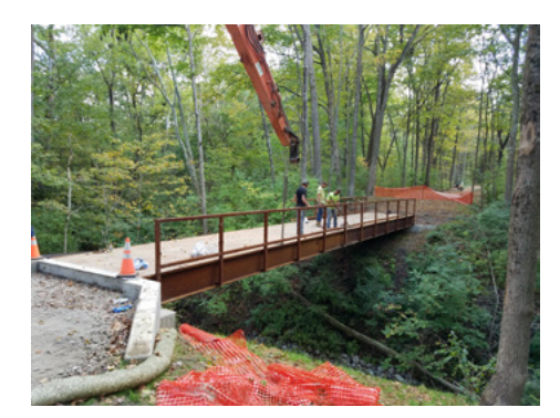
A bridge under construction along a new segment of the Camp Chase Trail in Battelle Darby Creek Metro Park.

Transportation Study (LCATS) will be moving forward with land acquisition for a .2 mile segment and the surrounding 40 acres that was funded by