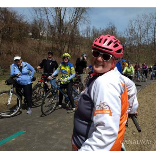
Opening Day for Trails in Cleveland

In March, Preservation Parks cleared 3.5 miles of downed trees and brush from the trail corridor recently purchased (NE of Sunbury). The corridor isn't open to the public yet but is now walkable by staff, engineers and contractors as we proceed with implementing the trail.