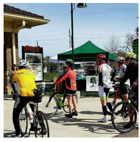
Opening Day for Trails in Knox County at the CA&C Mount Vernon depot

Progress is underway along the Cleveland Lakefront Bikeway Connector, which will connect the Cleveland Foundation Centennial