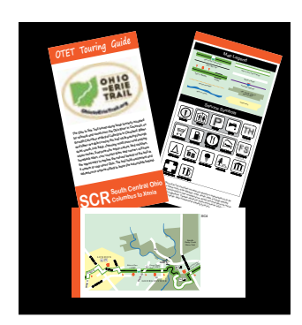
In 2018, guides have been mailed to 24 states.

The newly redesigned OTET Tour Guides, with complete mileage charts, are available for your planning, available at www. OhiotoErieTrail.com for just $15. Become a Friend of the OTET and save $5 on your Tour Guide order.