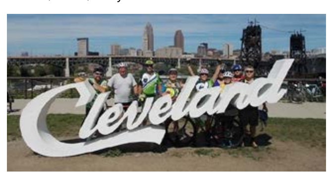
2017 Adventure Riders

The ride was a major fund raiser for the trail's