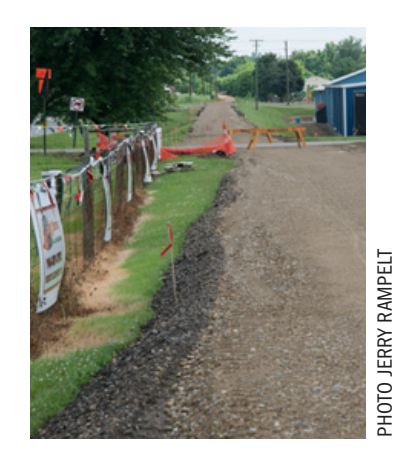
New trail construction in Mount Vernon will add will add safety and convenience to the Ohio To Erie Trail.

He passed through London in Madison County in the midst of